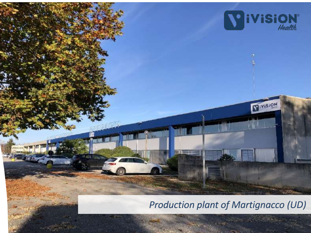
Production plant of Martignacco (UD)