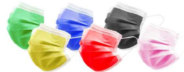
iViColor SURGICAL MASK

Type II high filtering mask Outer Layer: 25 gr. Filter Layer: 35 gr. Outer Layer: 25 gr. B.F.E. ≥ 98%