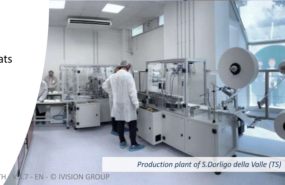
Production plant of S. Dorligo della Valle (TS)