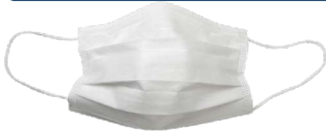
+Forti SURGICAL MASK

Type II high filtering mask Outer Layer: 25 gr. Filter Layer: 35 gr. Outer Layer: 25 gr. B.F.E. ≥ 98%