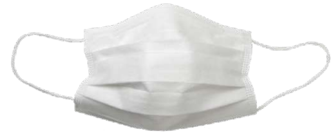
iViLight / iViWhite SURGICAL MASK

Type II high filtering mask Outer Layer: 25 gr. Filter Layer: 35 gr. Outer Layer: 25 gr. B.F.E. ≥ 98%