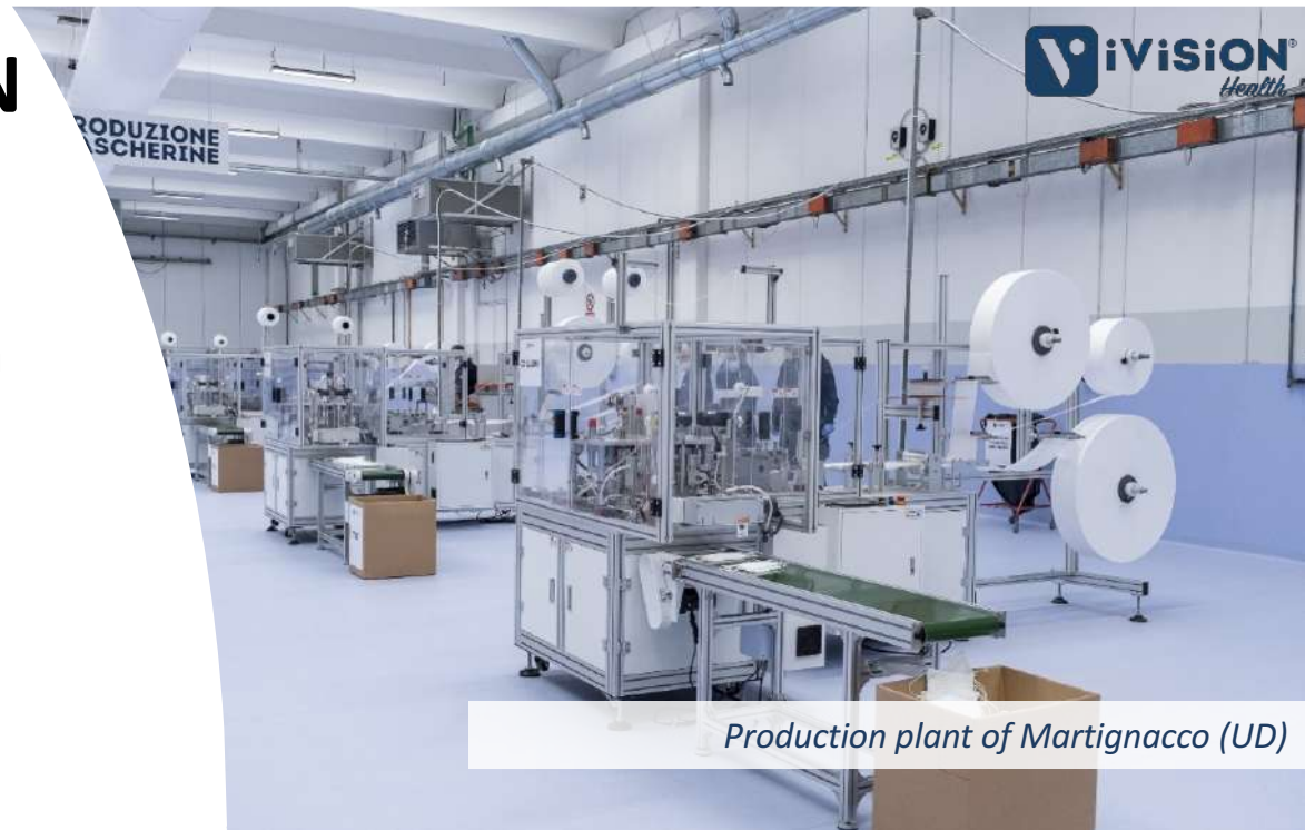
Production plant of Martignacco (UD)