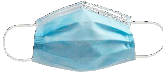
iViBlue SURGICAL MASK

Type II high filtering mask Outer Layer: 20 gr. Filter Layer: 25 gr. Outer Layer: 25 gr. B.F.E. ≥ 98%