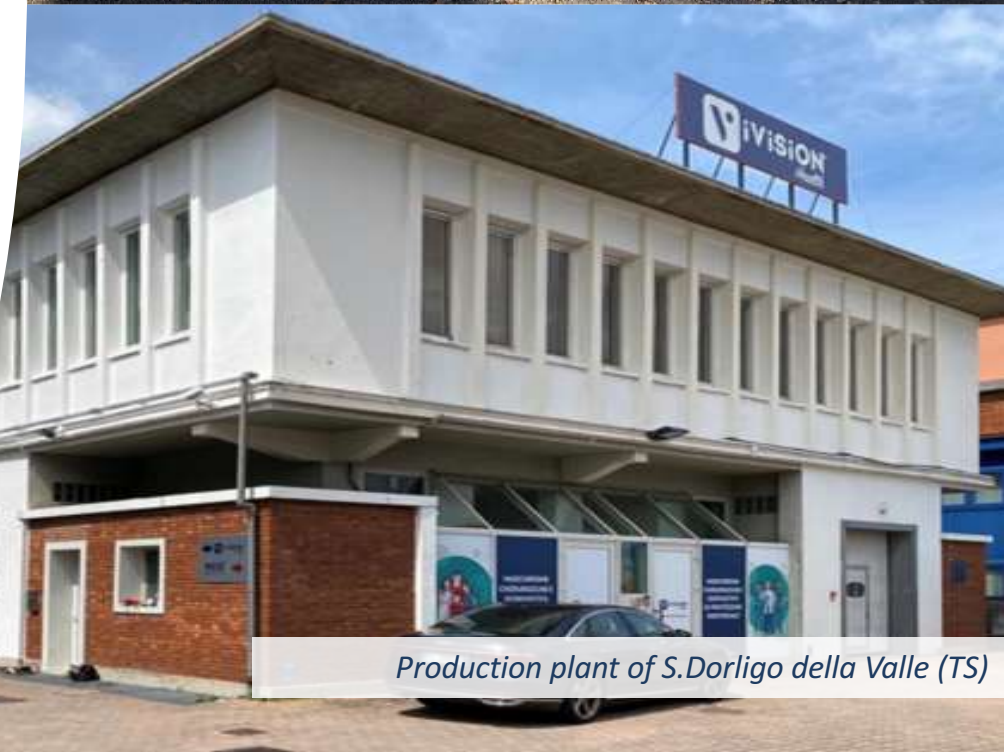
Production plant of S. Dorligo della Valle (TS)